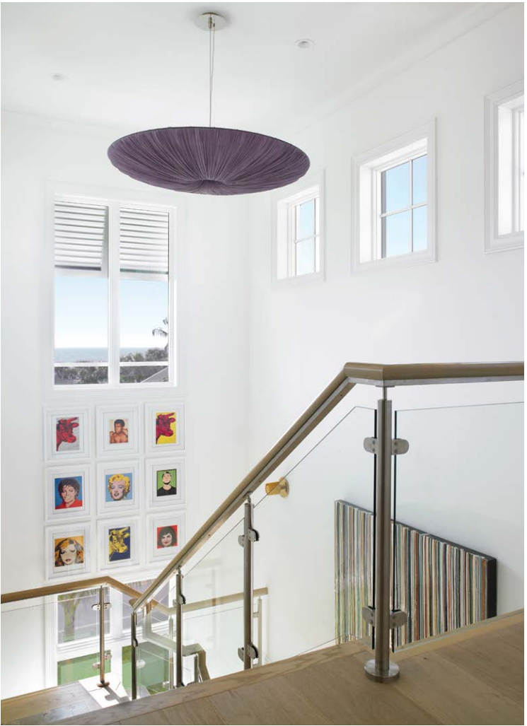
ABOVE: A stairwell reveals a wall populated by Andy Warhol prints as an homage to the homeowners' hometown of Pittsburgh.