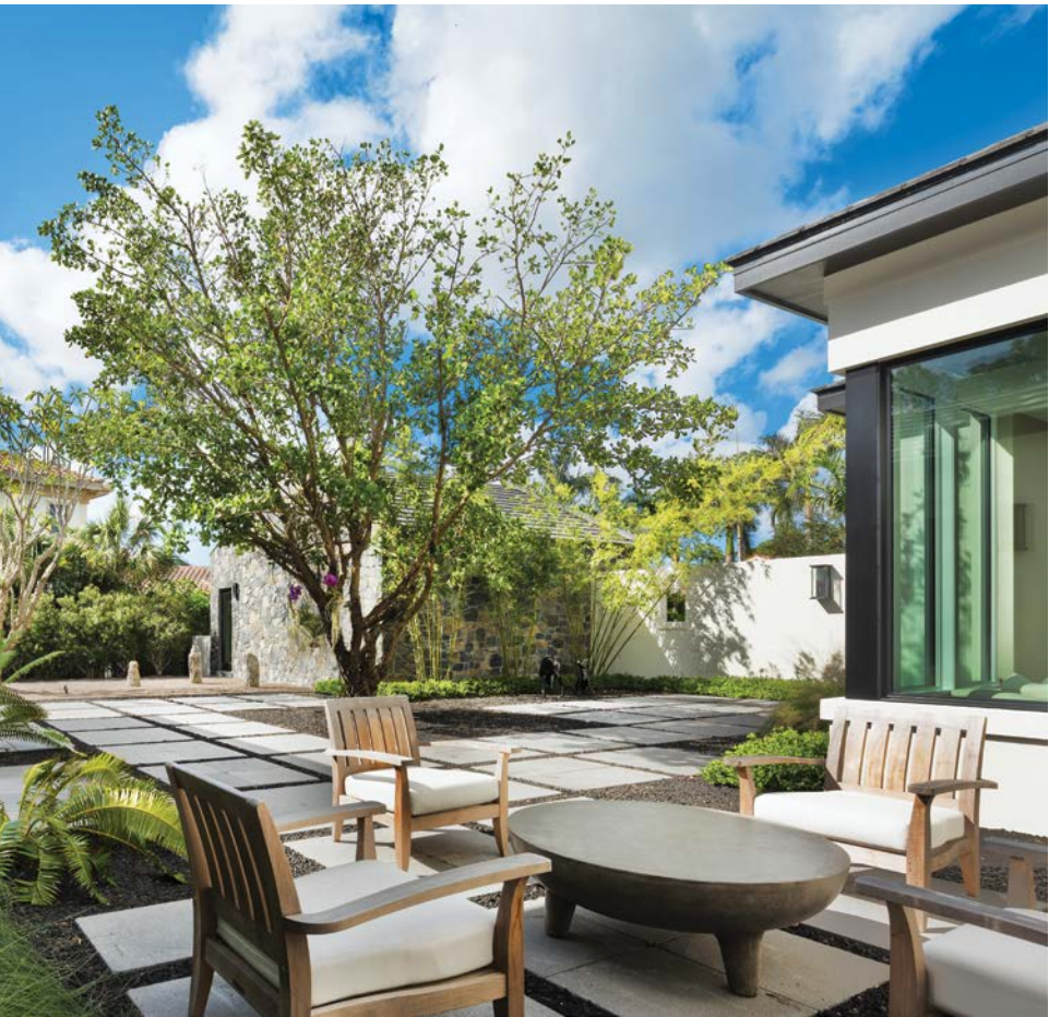
ABOVE AND RIGHT: The front courtyard pays homage to a graceful silk floss tree. The Japanese sand garden in the far corner balances a stone-clad wall that surrounds a separate garage structure. Teak chairs in the conversation space and bleached teak loungers aside the 60-foot-long pool are from Duo Designs. Wood decking alongside the preserve leads to a private meditation space.